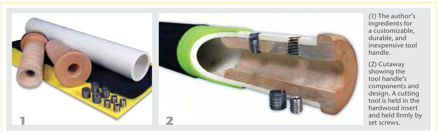
(1) The author's ingredients for a customizable, durable, and inexpensive tool handle.