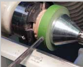
Cut a masking tape roll to the width you need.